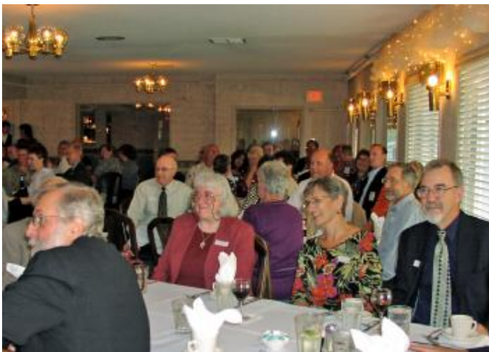
Faces in the crowd.....