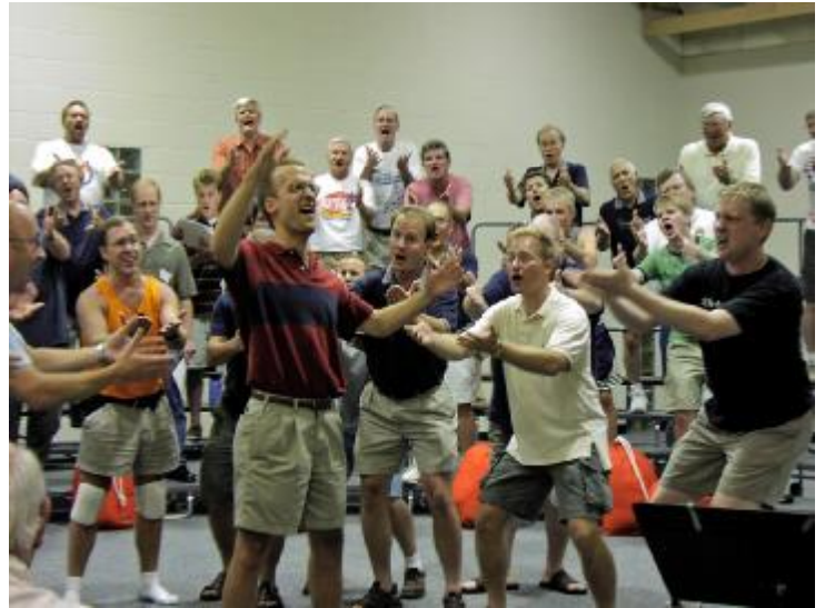
When will he yell.....

Getting ready for district in October has been a challenge with all the new choreography in "When the Midnight Choo Choo leaves for Alabam". We debuted the contest package at the Fairmont show September 19. Appleton here we come!