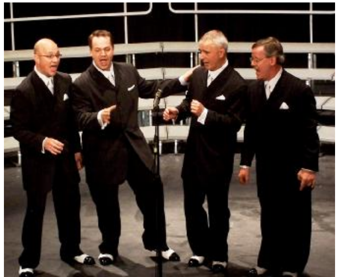
After Midnight (above) and Men at Work (below) helped to entertain the audience at the Fairmont Opera House.