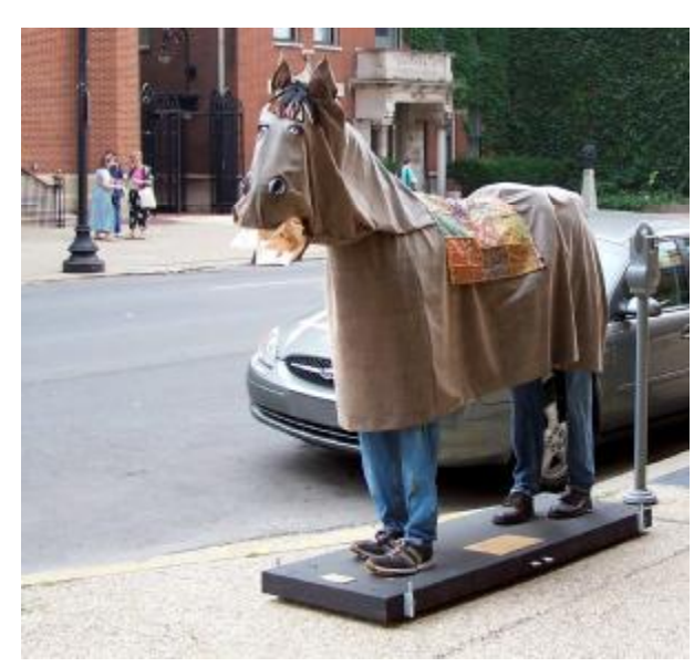
"people" horse noticed outside the gospel sing

Jan 22, 2005 January Show Bethel College