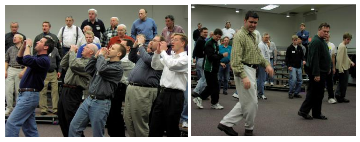
Blow that horn