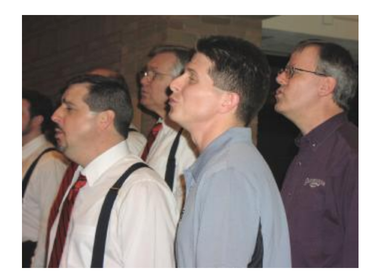
Give me a good "Oooo"

While the "deadline" for bringing your (pre-priced) items to the Erlandson's Eden Prairie home is past, we suggest that if you have some choice items, please call to arrange delivery to them ASAP.