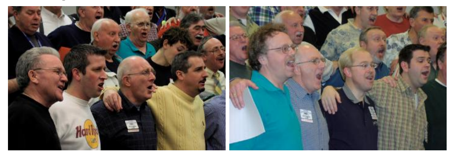
May the Road Rise to Meet You ...