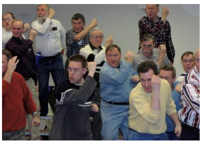
Where's my hat?