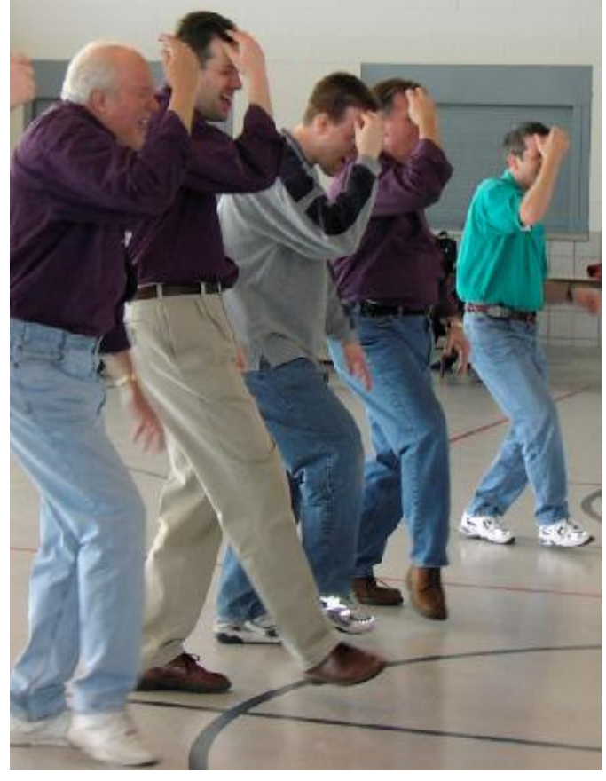
The front row 'Workin' It'