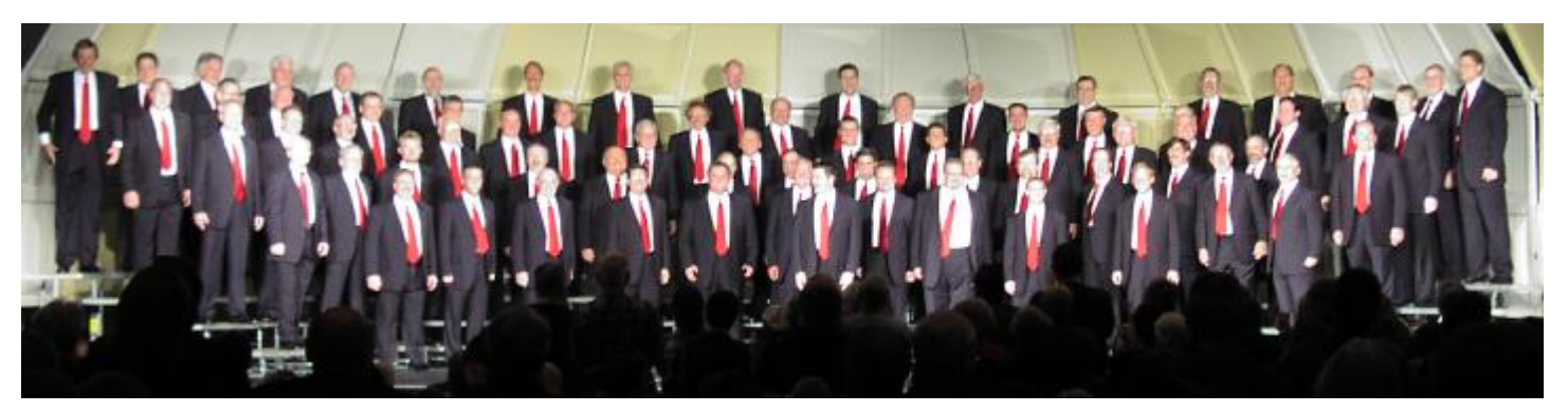
The Great Northern Union on stage in Fargo