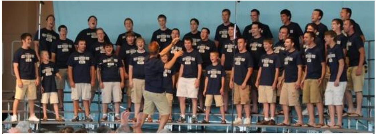
1 st Ever GNU Summer Collegiate Chorus Wows Como Crowd!