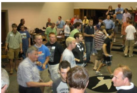
GNU Summer Collegiate Chorus

Vocality will be the seventh quartet to be judged and Expedition will also compete in the 19 th slot among the 51 qualifying groups in the Quartet Quarter-finals today.