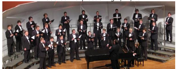
St Cloud State University Men's Choir 4/29/10