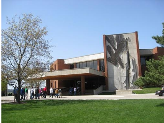
Luther College Center for Faith & Life