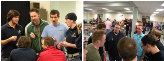
Tagging with the Statesmen