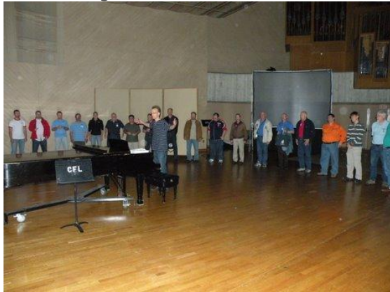
Go the Distance