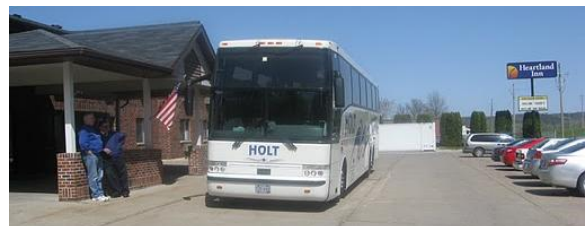
The Bus that transported most of the GNU to Decorah, IA