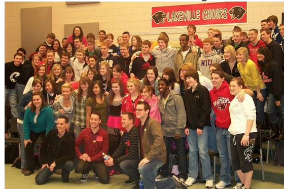
The Vagrants also did clinics at Twin Cities' area schools