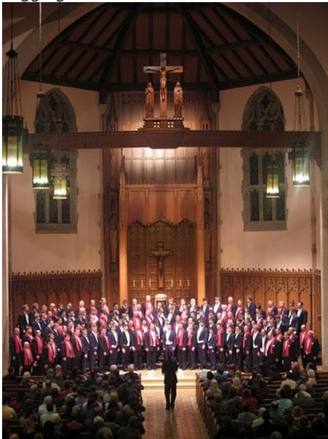
Church of the Nativity, St Paul, MN