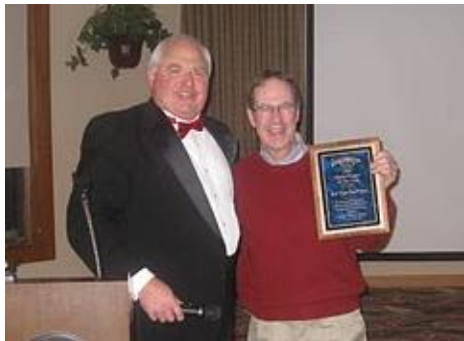
Barbershopper of the Year