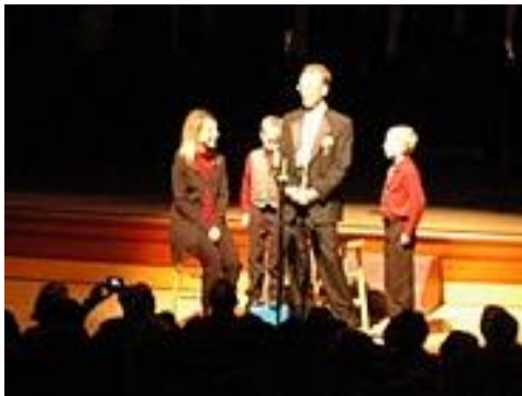
Benson Family Singers