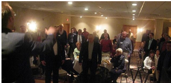
Go the Distance