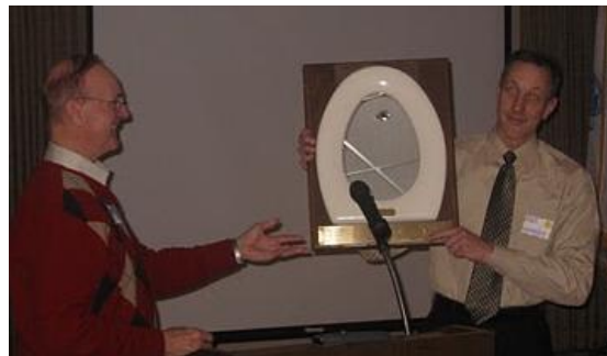
Best Improved Face

exciting things planned for next year and the silver anniversary season in 2011. The evening concluded with the singing of “Go The Distance”.