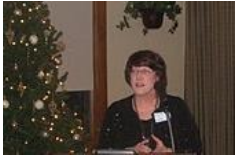
Theresa Meyer Memorial Award