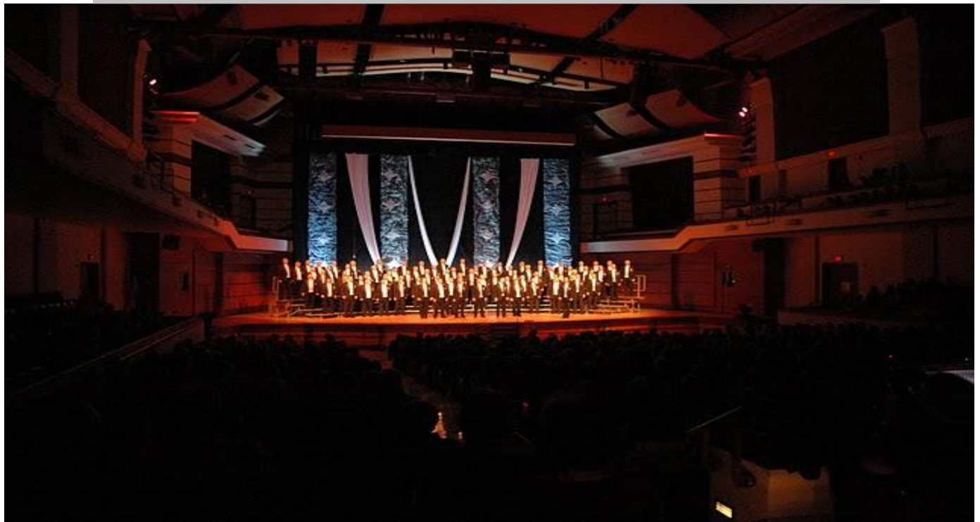
Great Northern Union Saturday November 21 st at Benson Great Hall, Bethel University, St Paul, Minnesota