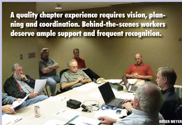
A quality chapter experience requires vision, planning and coordination. Behind-the-scenes workers deserve ample support and frequent recognition.