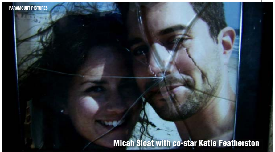
Micah Sloat with co-star Katie Featherston

recently moved into their first home. Katie is disturbed by nighttime events that remind her of haunting childhood experiences. Micah at first refuses to take these events seriously, but leaves his video camera running at night to capture what is happening while they sleep. (The entire film is recorded from his camera's perspec-