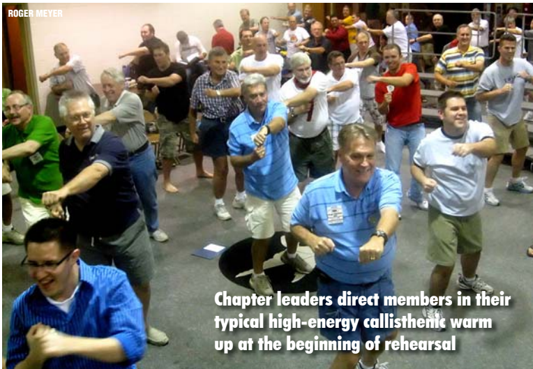
Chapter leaders direct members in their typical high-energy callisthenic warm up at the beginning of rehearsal